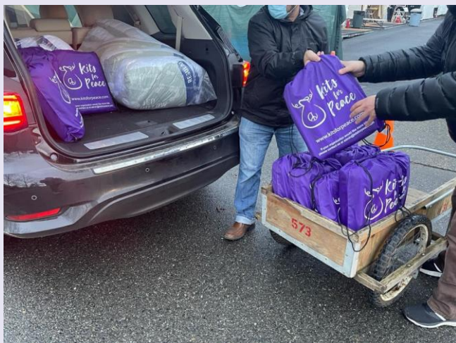
Blankets and Pillows from MAPS-MCRC and Kits for Peace