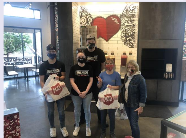
MOD Pizza Totem Lake Lunch for Move