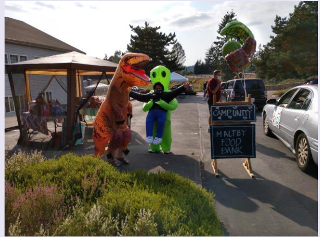
Woodinville Church of Christ Supply Drive