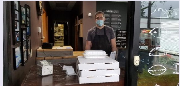
Rocky's Empanadas Lunch for Move